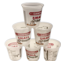
C950-35890-99 Small Campy Cup 6oz

Call 800-745-1778 to order M.L. Campbell products today