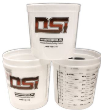
C-DSI165-5QT EZ Mix 5 Quart Cup