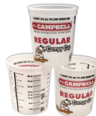
C950-35880-99 Quart Measuring Cup 32oz