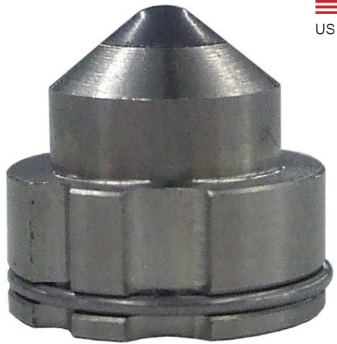
36-100-10 Tip Screen

*Remove Tip Ring to Replace in Kremlin™ AAA Spray Gun